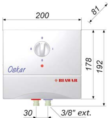
OSKAR OP-5 U/P/S/C